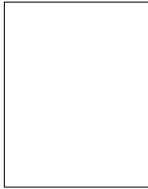
Parents Passport Photo